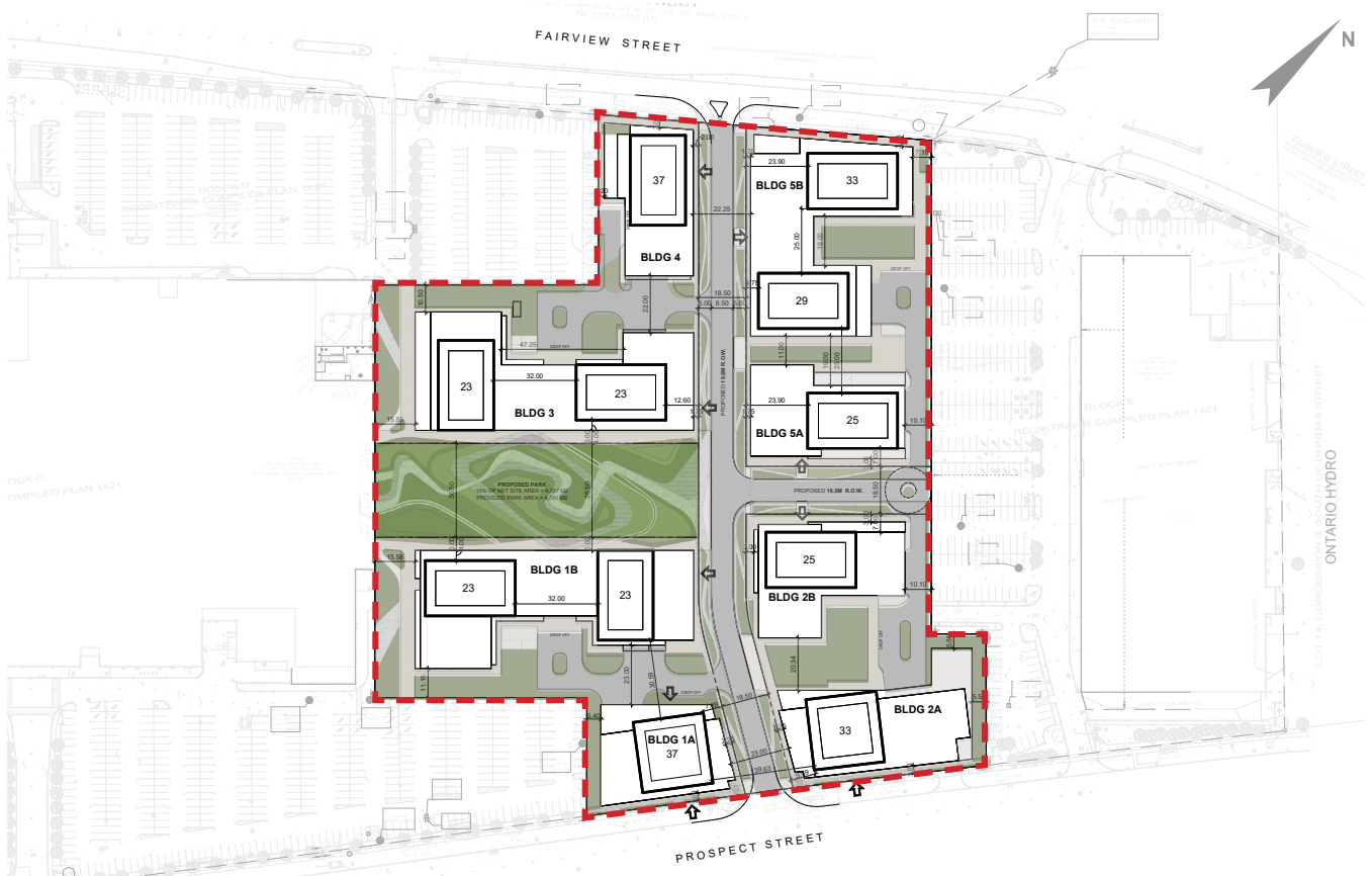
Draft Site Plan

We are pleased to invite you to a hybrid open house to obtain additional information and receive your feedback for the proposed project at 777 Guelph Line (a portion of the Burlington Mall complex). The Owner is seeking to redevelop the Subject Lands with a comprehensive mixed use development consisting of 8 buildings (11 towers) with heights ranging up to 37 storeys, and a public park. Overall, the development includes a total of 3,476 residential units. A retail gross floor area of 7,279 sq. m. and a residential gross floor area of 242,279 sq. m is proposed. The proposed density (FSI) is 6.14 times the lot area. One new north-south roadway and one new east-west roadway are included in the development.