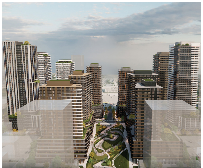
Proposed 3D Rendering