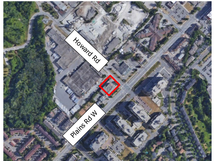
127 Plains Road West Location Plan

The City of Burlington Official Plan designates the property Mixed Use Nodes and Intensification Corridors in the 2020 Draft Burlington Official Plan. The subject lands are within the Aldershot Go Major Transit Station Area (MTSA) boundary. The designation permits and encourages high density, mixed-use developments in the vicinity of MTSA's. The subject lands are zoned Mixed Use Corridor in which permits a range of mixed uses such as residential, retail, and commercial.