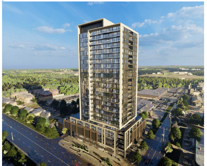
Preliminary Concept Rendering